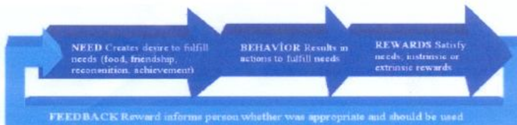
Table 2: Model of Human Motivation

If motivation is seen as a process, a simple model of human motivation can be illustrated as seen in the Table 2. In accordance with the process model, motivation can be examined as if the regulation is as an open system approach. According to the process model, motivation process can be divided into four important sub-titles. The first one is related to human basic needs such as for food, achievement, or monetary gain, that translate into an internal tension that motivates specific behaviours with which fulfil the need. The person is rewarded in the sense that the need is satisfied. The reward also informs the person that the behaviour was appropriate and can be used again in future.