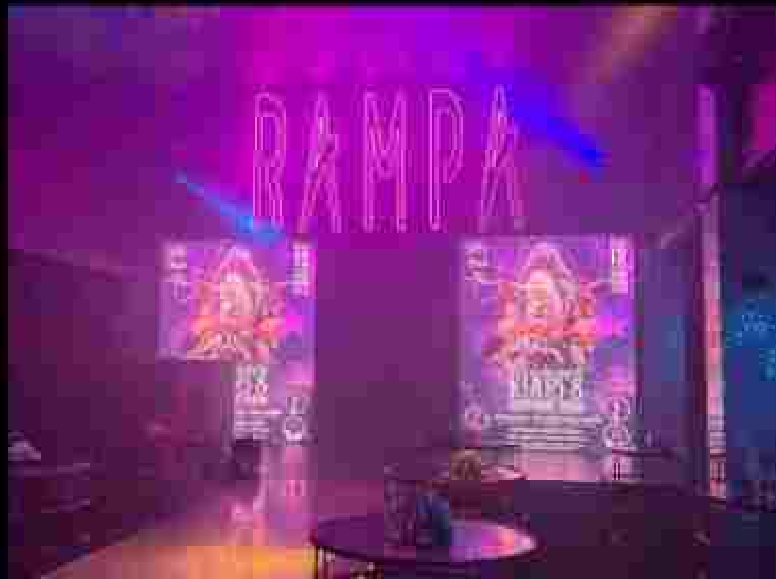
Rampa Drag Club