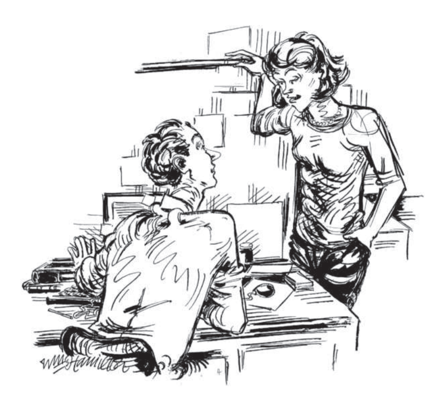
"Tve done the numbers, and I will marry you."

Sequence plays a large part in evaluating a relationship. The result from each interaction is stored in the individual's memory. Experiences that take place early in a relationship can have a huge impact because they make up a large proportion of the total relational history. One unpleasant experience out of 10 is merely troublesome, but 1 out of 2 can end a relationship before it really begins. Trends are also important. If Pete first senses coolness from Jon yet later feels warmth and approval, the shift might raise Jon's attractiveness to a level higher than it would be if Pete had perceived positive vibes from the very beginning.