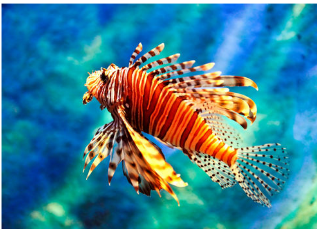
The red lionfish ( Pterois volitans ), an alien invasive