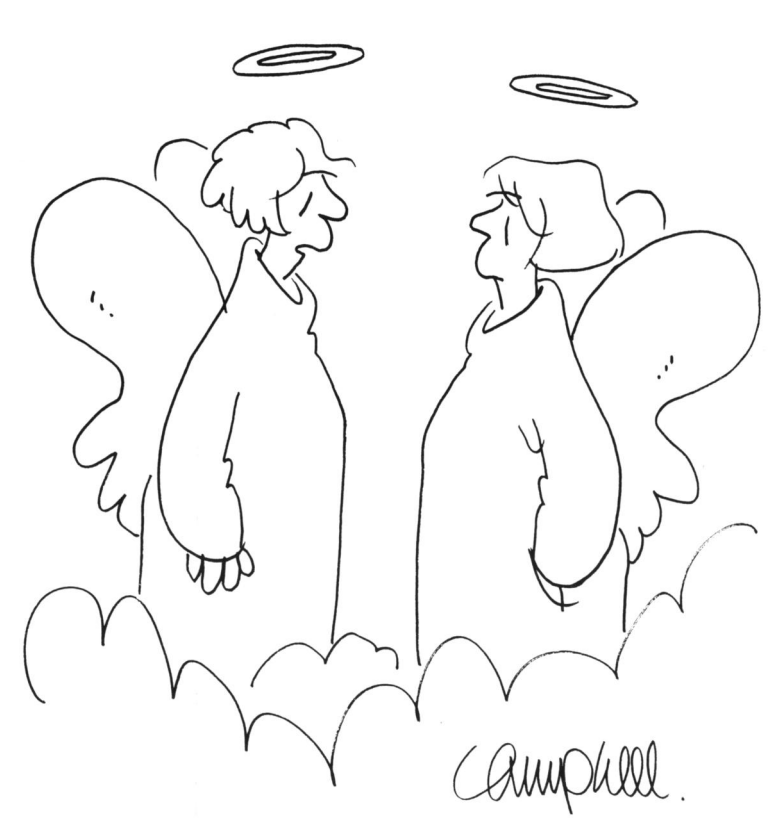
"I was a teacher. I miss snow days."

In Finland, high-stakes testing plays no role in teacher evaluation. The only standardized tests are sample-based assessments given at grades 6 and 9 to inform policy and curricular decisions, and the matriculation examination for university admission. Finnish students are tested, of