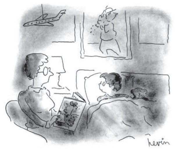
"And what's the story behind the story?"