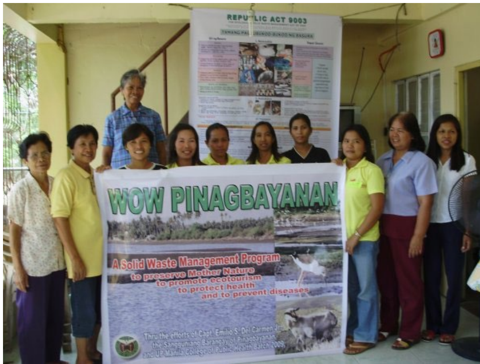
Barangay-based Solid Waste Management Program in San Juan.

Most of the collective efforts by Amiga and UP have since then been geared towards achieving the main objective. These efforts included the following: (1) engagement of organized groups and interested individuals so they can be partners in the program; (2) regular community readiness assessment; (3) preparatory activities for the screening of all adults 25 years old and above in the barangays; (4) risk assessment using the DOH PhilPEN Risk Assessment Form and data management; (5) development, implementation and monitoring of barangay action plans based on the risk assessment data and on the factors that came out during the problem analysis in 2013.