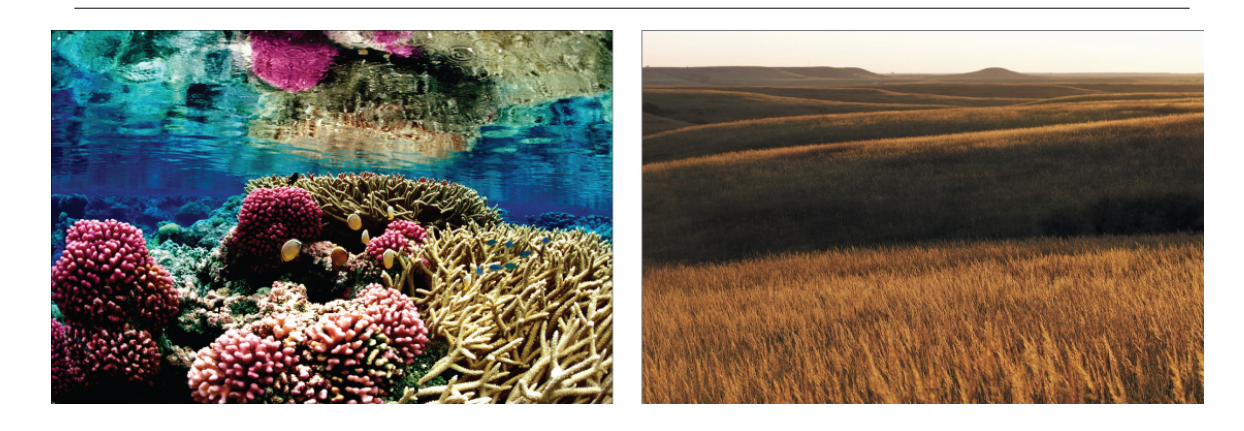
Figure 2: The variety of ecosystems on Earth—from coral reef to prairie—enables a great diversity of species to exist. (credit "coral reef": modification of work by Jim Maragos, USFWS; credit: "prairie": modification of work by Jim Minnerath, USFWS)

An example of a largely extinct ecosystem in North America is the prairie ecosystem (Figure 2). Prairies once spanned central North America from the boreal forest in northern Canada down into Mexico. They are now all but gone, replaced by crop fields, pasture lands, and suburban sprawl. Many of the species survive, but the hugely productive ecosystem that was responsible for creating our most productive agricultural soils is now gone. As a consequence, their soils are now being depleted unless they are maintained artificially at greater expense. The decline in soil productivity occurs because the interactions in the original ecosystem have been lost; this was a far more important loss than the relatively few species that were driven extinct when the prairie ecosystem was destroyed.