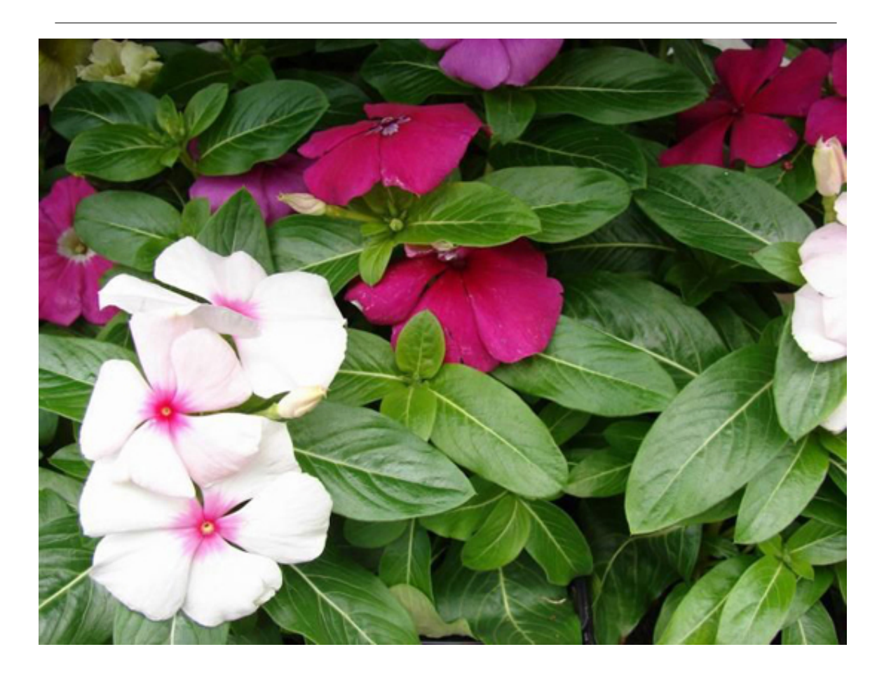
Figure 4: Catharanthus roseus, the Madagascar periwinkle, has various medicinal properties. Among other uses, it is a source of vincristine, a drug used in the treatment of lymphomas.

In recent years, animal venoms and poisons have excited intense research for their medicinal potential. By 2007, the FDA had approved five drugs based on animal toxins to treat diseases such as hypertension, chronic pain, and diabetes. Another five drugs are undergoing clinical trials and at least six drugs are being used in other countries. Other toxins under investigation come from mammals, snakes, lizards, various amphibians, fish, snails, octopuses, and scorpions.