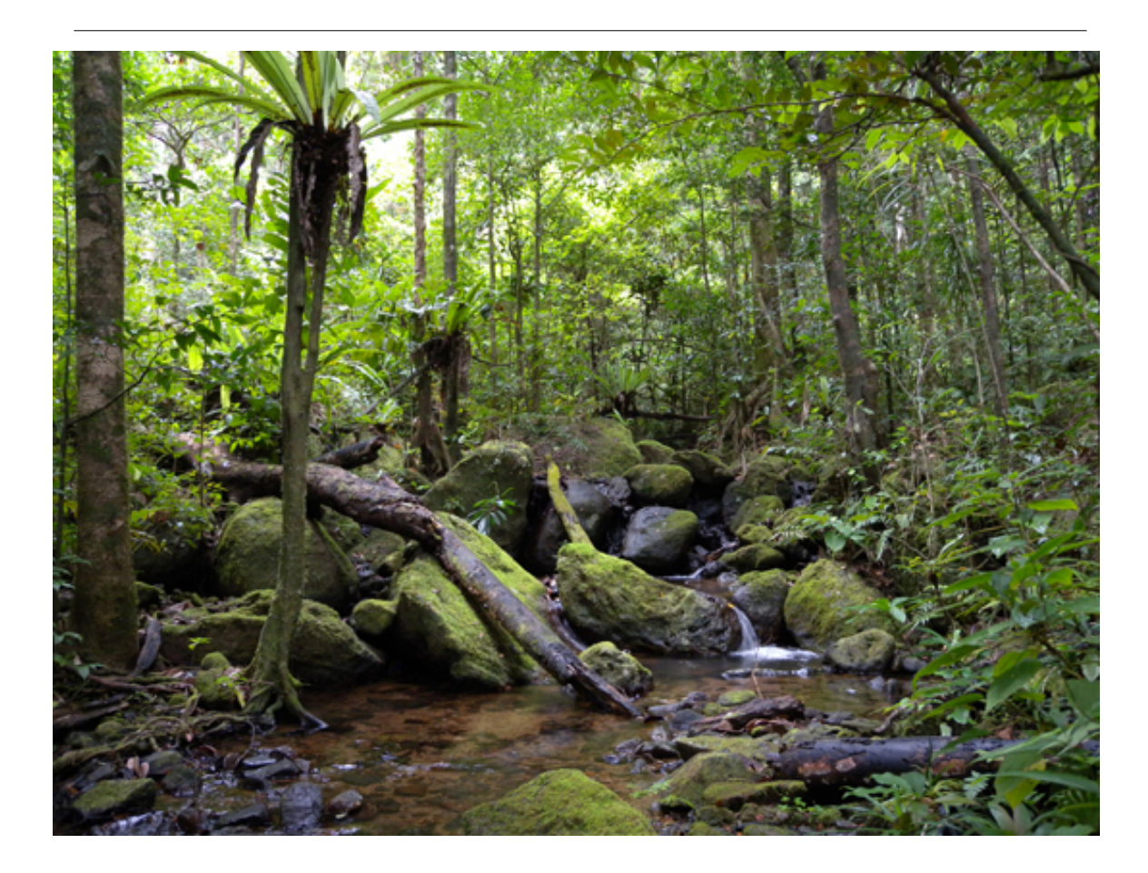
Figure 1: This tropical lowland rainforest in Madagascar is an example of a high biodiversity habitat. This particular location is protected within a national forest, yet only 10 percent of the original coastal lowland forest remains, and research suggests half the original biodiversity has been lost.

Biodiversity is a broad term for biological variety, and it can be measured at a number of organizational levels. Traditionally, ecologists have measured biodiversity by taking into account both the number of species and the number of individuals in each of those species. However, biologists are using measures of biodiversity at several levels of biological organization (including genes, populations, and ecosystems) to help focus efforts to preserve the biologically and technologically important elements of biodiversity.