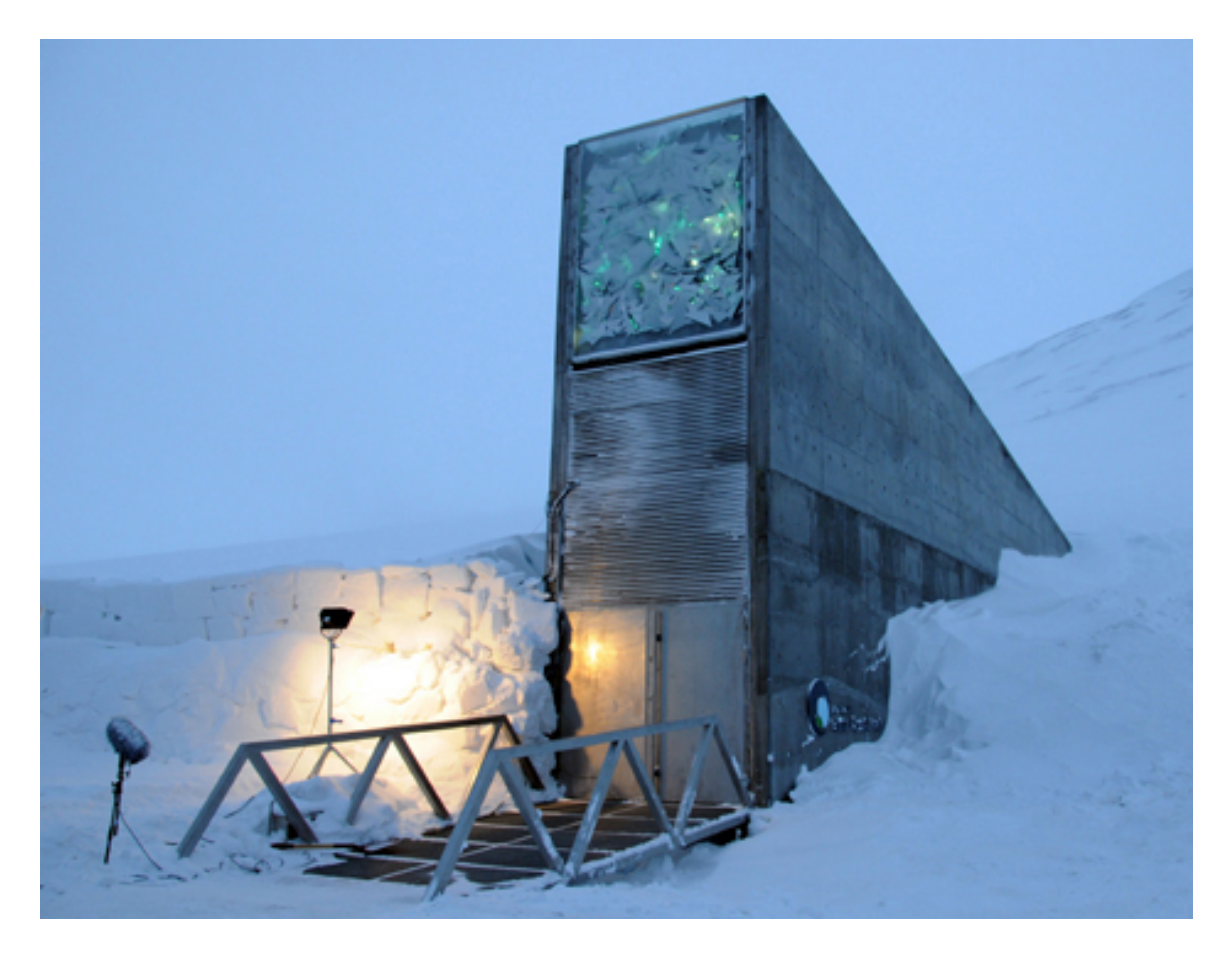
Figure 5: The Svalbard Global Seed Vault is a storage facility for seeds of Earth's diverse crops.

The Svalbard seed vault is located on Spitsbergen island in Norway, which has an arctic climate. Why might an arctic climate be good for seed storage?